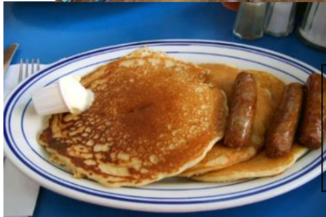
Sugar Bush Pancake Breakfast March 24th

Help send kids to Camp...Become a Pelican Club or Timber Society member today. Pelican Club members support the ministry with a gift of $100 - $499 a year and Timber Society members give $500 or more a year. Thanks for your support!